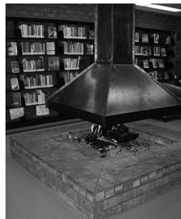
Stay cozy at the Library!