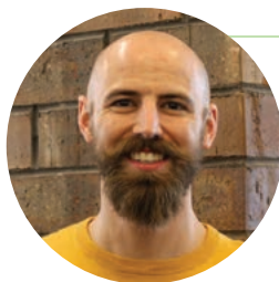
Chase Adult Services Associate